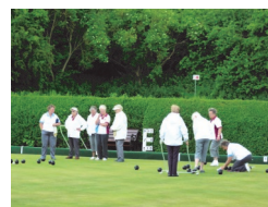
Flat Green Bowls