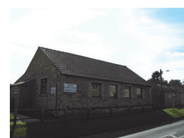
Swinton Reading Room And Community Hall