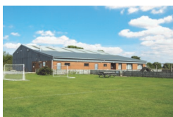
BSA Sports Centre

For more information or to Book the Facilities inside, or outdoor Pitches.