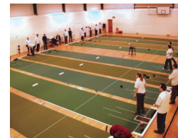
Short Mat Bowls