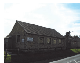
Swinton Reading Room And Community Hall