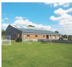
BSA Sports Centre